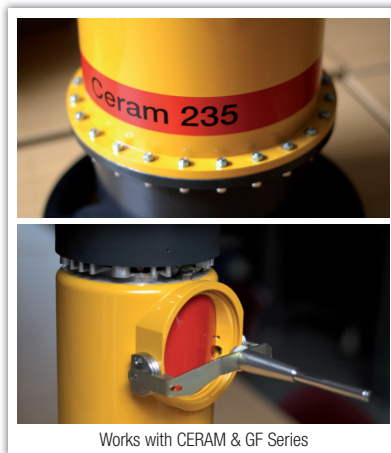
Works with CERAM & GF Series