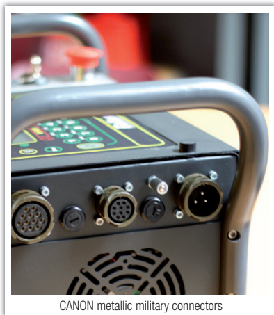
CANON metallic military connectors