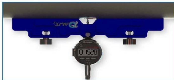
A center gauge holder with two magnetic extensions being used upside down with the dial indicator face rotated for easy reading.