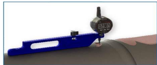
A blind end gauge holder with one extension measuring corrosion next to a weld seam.