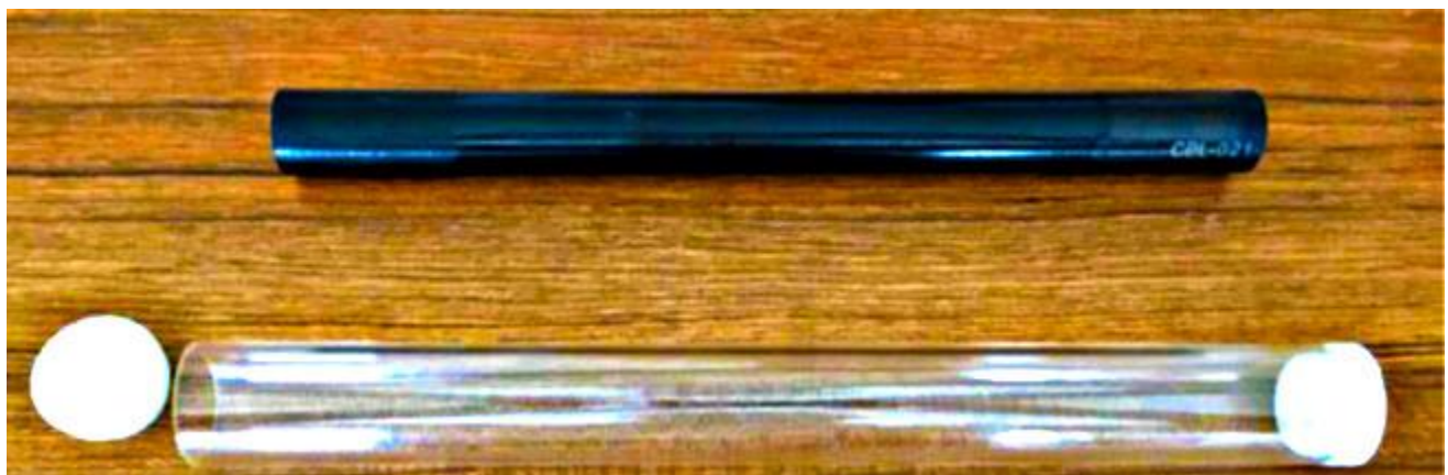
CB Bar with Protective Tube

Cracks are created by a proprietary process. Every bar is different.