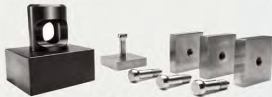
PosiTest AT 50T KIT converts the adhesion tester to measure the tensile strength of ceramic tile adhesives.