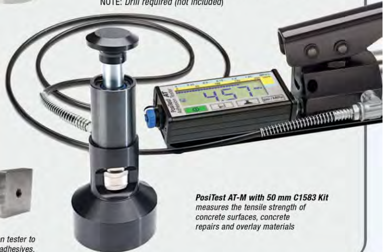
PosiTest AT-M with 50 mm C1583 Kit measures the tensile strength of concrete surfaces, concrete repairs and overlay materials