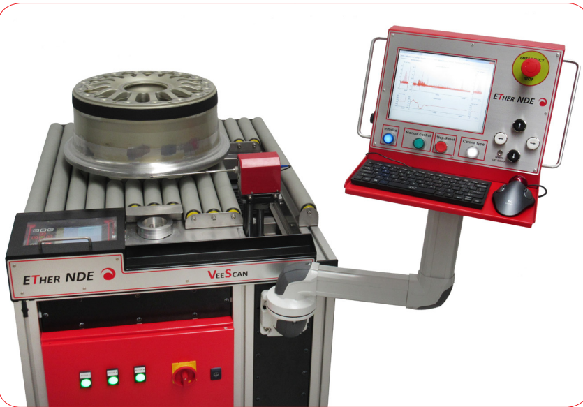
VeeScan Pivot Arm Option.

At ETHER NDE we understand that the key criteria for any Aircraft Wheel Inspection System is the need to guarantee detection of defects, the requirement to operate reliably twenty-four hours per day, 365 days per year. The demand for a simple and user-friendly interface and the business need to maximize speed of inspection and output is key. Balancing these objectives can be difficult, but we believe the VEESCAN measures up to the task.