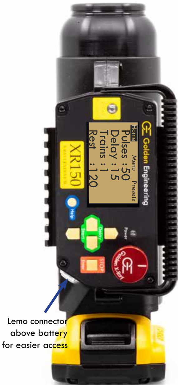
Lemo connector above battery for easier access