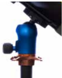
Integrated Arca Swiss tripod mount