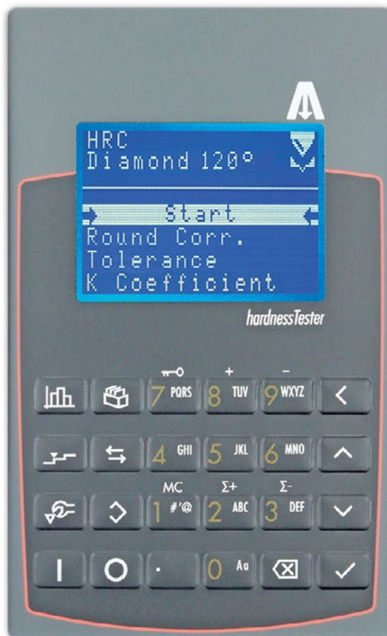
Touch key pad board IP 64 protection

Data output via RS 232 C for connection to printer and computer for diagram plotting and statistics. Hyperterminal is needed. Available USB adapter.