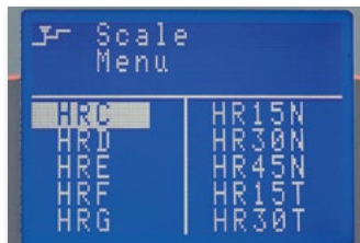
Set of the hardness test methods

The AFFRI software controls the whole instrument during the entire cycle avoiding human errors. The tester can easily be used by operator of every level.