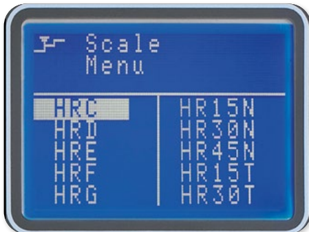
Set of the hardness test methods