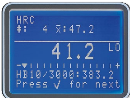
Results with average and conversion