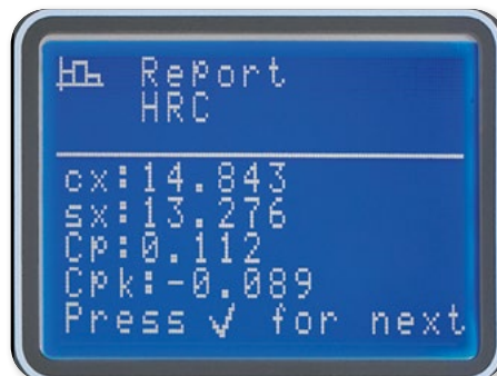
Storable and printable statistics