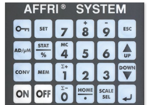
Intuitive keyboard with direct commands. Touch key pad board IP 64 protection.