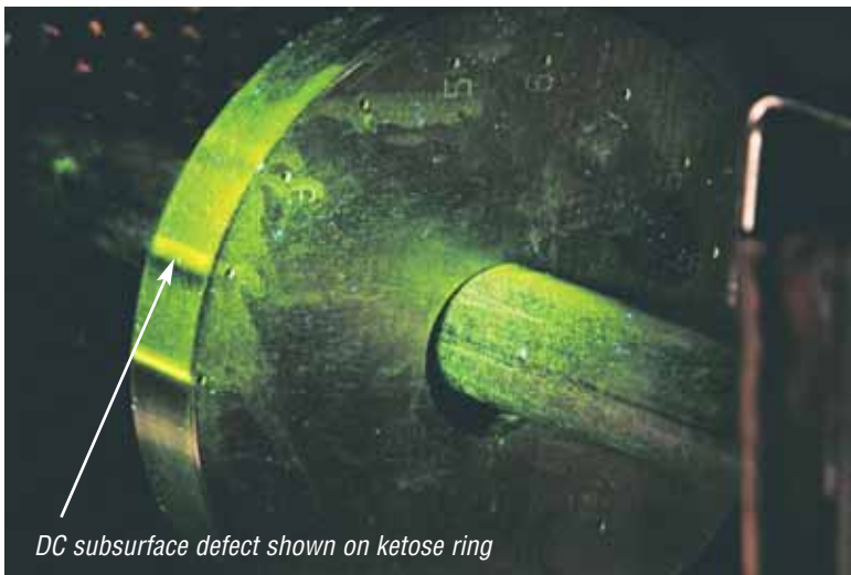
DC subsurface defect shown on ketose ring