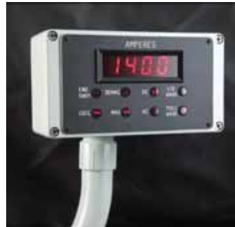
Digital Readout Display