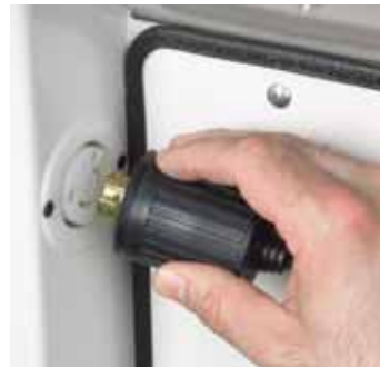
Black Light Locking Electrical Plug