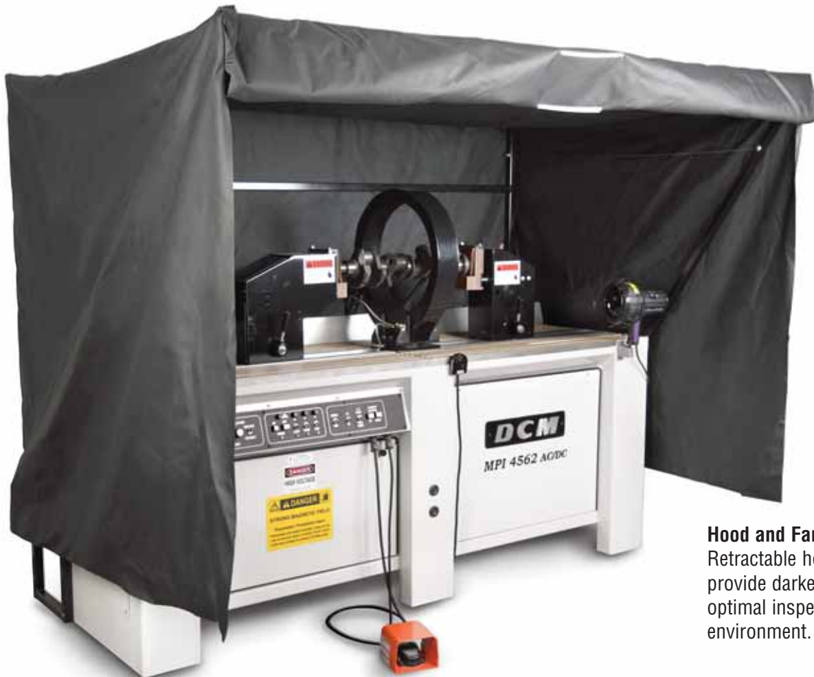
Hood and Fan (standard) Retractable hood and fan provide darkened area for optimal inspection environment.