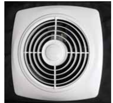
Circulation Fan Inside Hood