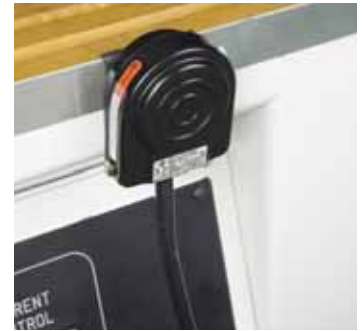
"Hands Free" Cycle Switch