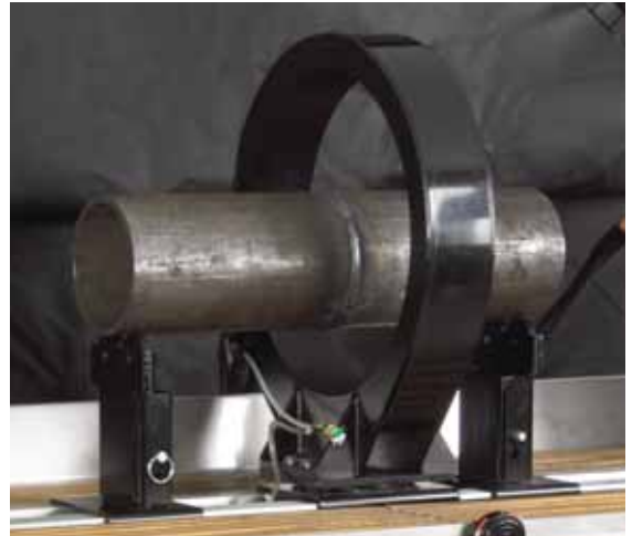
Welded pipe sections mounted in MPI 4562. Coil shot or head shot chosen by a flip of a switch.

*Contact DCM Tech representative for other voltage options