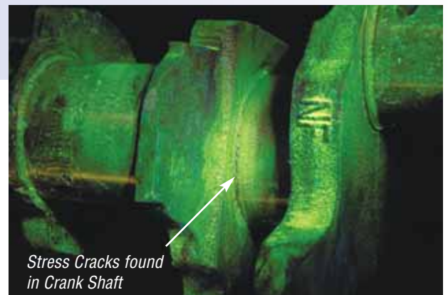
Stress Cracks found in Crank Shaft