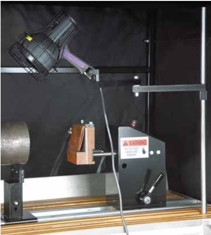
Black Light Inspection Stand