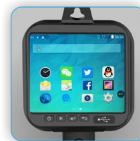
Android Based O/S