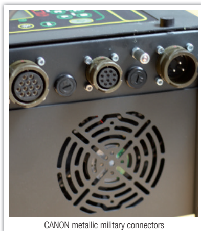
CANON metallic military connectors