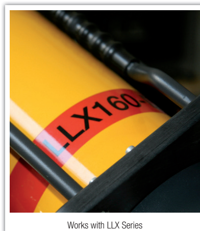
Works with LLX Series