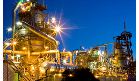
Oil and Gas