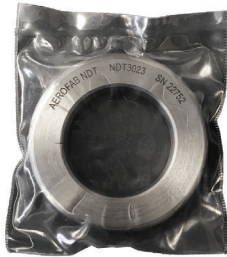
oil-protective coating to prevent corrosion