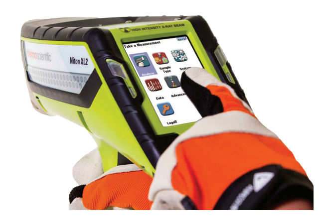
The Thermo Scientific™ Niton™ XL2 Plus handheld XRF analyzer.

when it's time to replace a low battery. While an integrated micro camera and nose guard alignment provide precise sample positioning for each measurement.