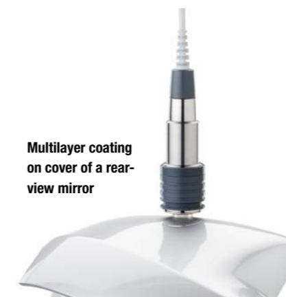
Multilayer coating on cover of a rear-view mirror