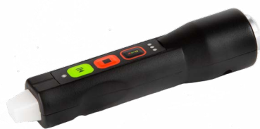
Pencil Probe - Straight