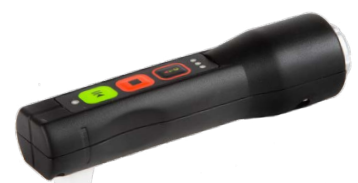
Pencil Probe - 90° Transverse