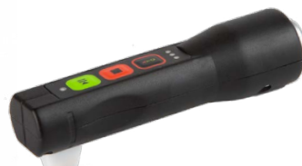
Pencil Probe - 90° Inline