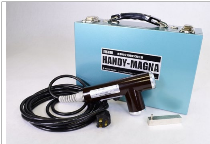
HM-52L Corner Yoke Kit

Eishin has discontinued the special “L” shaped 10# Test Bar. They now include an Adapter Bar which is a small, laminated bar that attaches to the HM-52L and allows it to be used with a standard 10# test bar for verification of lifting strength as shown below.