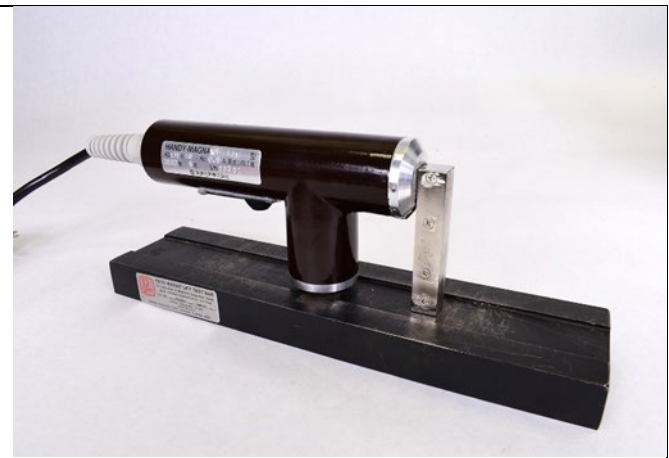
HM-52L with Adapter Bar and 10# Test Weight Bar