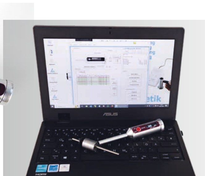
Lima Connect to evaluate the measurement results on the PC