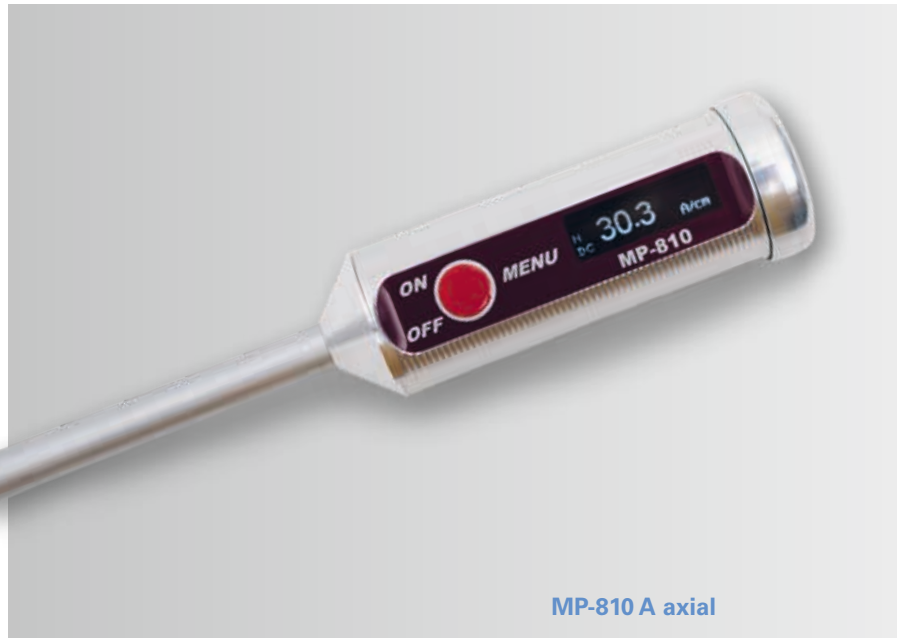
MP-810 A axial

To measure accurately all kinds of magnetic fields: AC fields, DC fields and maximum values in impulse fields.