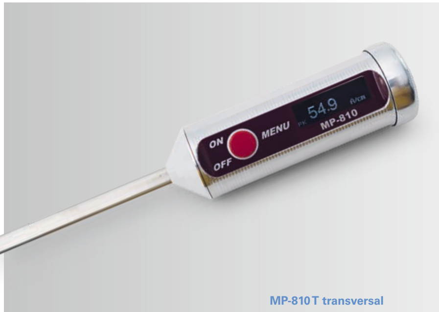
MP-810 T transversal

The tangential field probe measures in 90 degree angle to the probe axis particularly in air gaps, cavities and on the surface of workpieces, suitable for crack detection.