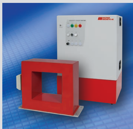
MM CT3-U MM DN1100