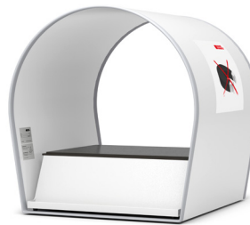
Zero Gauss chamber