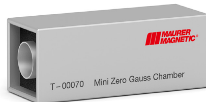
Mini Zero Gauss Chamber