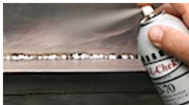
Typical aerosol application of D-70 during a weld inspection.