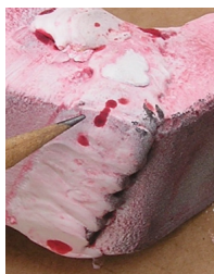
Visible penetrant crack indication on D-70

D-70 has been used in the 3-D laser scanning of automobiles and exotic components where it is used to reduce interference glare from shinier surfaces. It has been used to assist in the installation of aircraft doors as a marker for fit adjustments. All these applications require a low toxicity material that is readily removed with a water spray leaving a residue free surface.