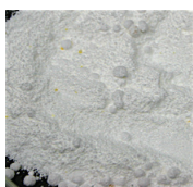
D-76B developer powder

After parts have been dipped into the developer, put them immediately into the dryer. Allowing part to remain in the wet developer, or to sit while wet for a period of time before drying can cause the penetrant to bleed from the defects, resulting in dim blurry indications. Immediate drying produces the best results. The dryer temperature should be set at the maximum allowable temperature of 160°F(71°C). If the surface of the part looks bluish under ultra violet light (UV-A), it is an indication that the parts have been in the developer bath too long and the bath is becoming contaminated with penetrant.