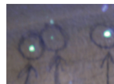
Fluorescent penetrant indication on D-76B