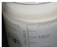
D-78B developer solution

After parts have been dipped into the developer, put them immediately into the dryer. Allowing part to remain in the wet developer, or to sit while wet for a period of time before drying can cause the penetrant to bleed from the defects, resulting in dim blurry indications. Immediate drying produces the best results. The dryer temperature should be set at the maximum allowable temperature of 160°F(71°C). If the surface of the part looks bluish under ultra violet light (UV-A) , or pinkish it is an indication that the parts have been in the developer bath too long and the bath is becoming contaminated with penetrant.