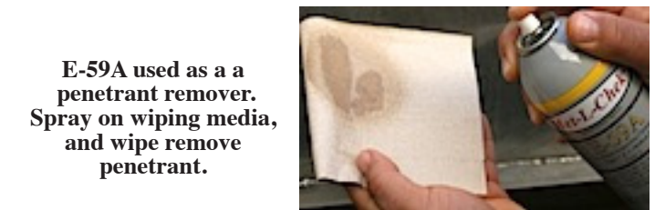
E-59A used as a penetrant remover. Spray on wiping media, and wipe remove penetrant.