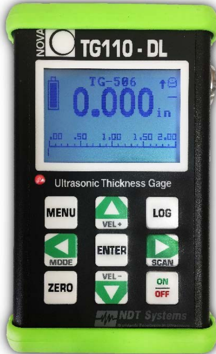
Customizable Data Logger