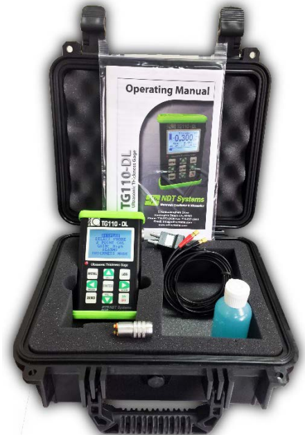
TG-110 Package including a probe