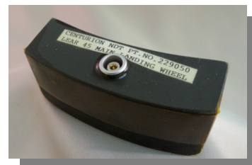
Shown with LEMO Connector