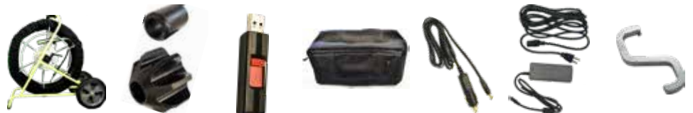
Debris Cover 2" & 3" Skids USB Stick Accessory Bag DC Power AC Power S-Tool