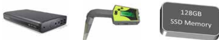
External Battery Locator 128 GB Internal Memory