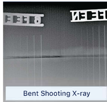
Bent Shooting X-ray