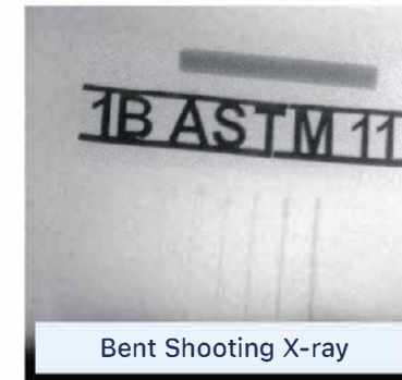
Bent Shooting X-ray