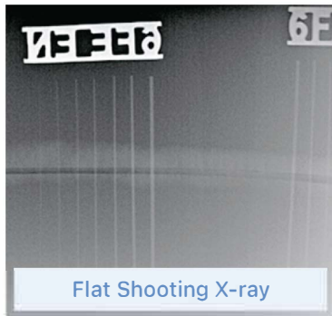
Flat Shooting X-ray