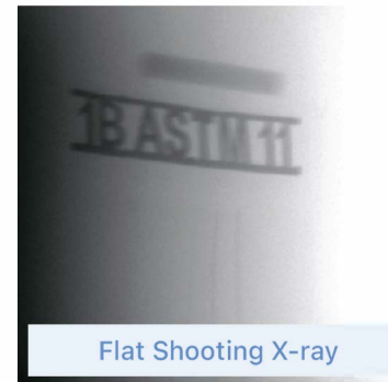
Flat Shooting X-ray