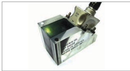
Phased array probes and wedges