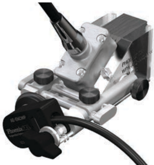
C-Clamp with rear mounted encoder and phased array probe and wedge