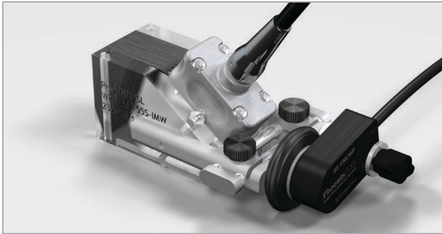
C-Clamp Encoder with phased array probe and wedge

The C-Clamp Encoder is a universal accessory for single axis inspections requiring no tools for setup and operation. The two clamping arms adjust up to 55mm separation to fit around a broad range of ultrasonic transducers and phased array wedges.