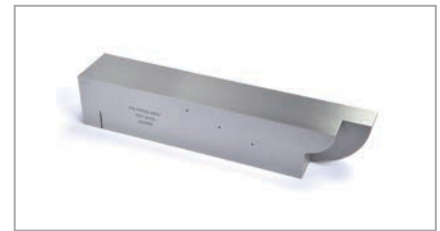
Phased array calibration block