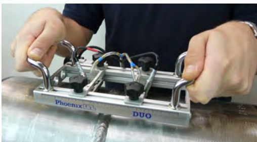
Hand-held Duo scanner

Designed to incorporate the most popular features of existing Phoenix TOFD scanners, Duo combines the benefits of simple, tool-less probe installation and adjustment with a sturdy frame complete with handles which ensure ease of operation and movement around pipes.