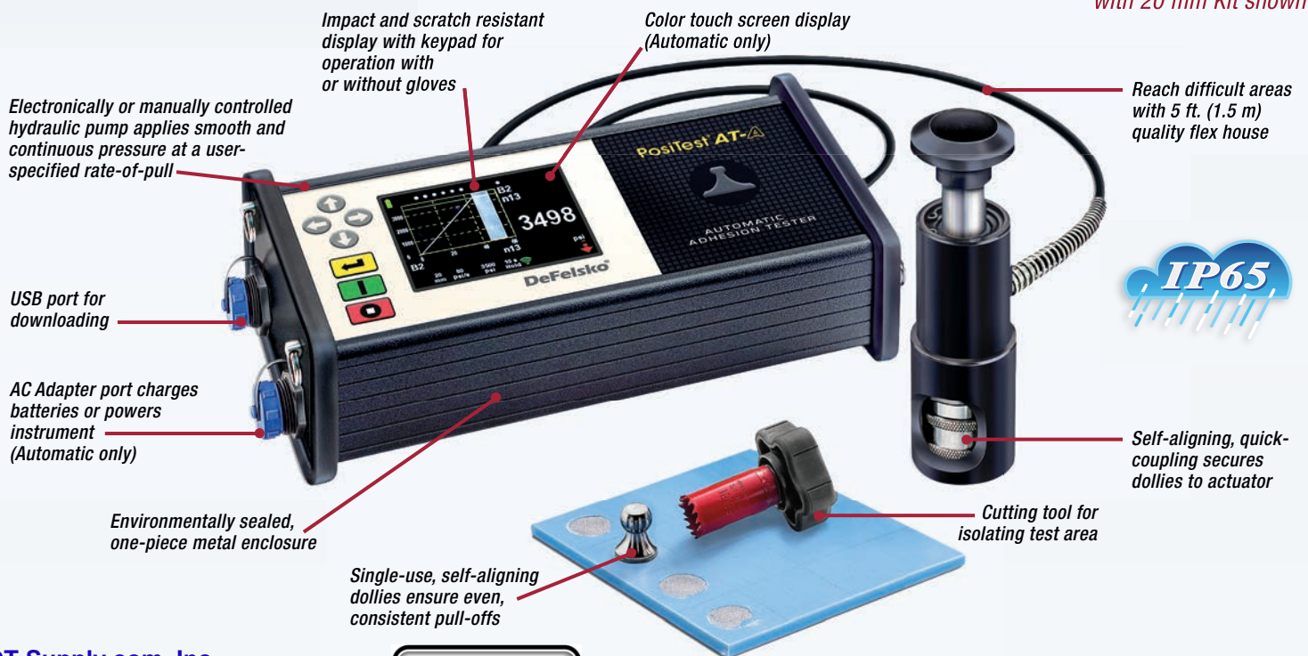
PosiTest AT-A Automatic with 20 mm Kit shown

Electronically or manually controlled hydraulic pump applies smooth and continuous pressure at a user-specified rate-of-pull