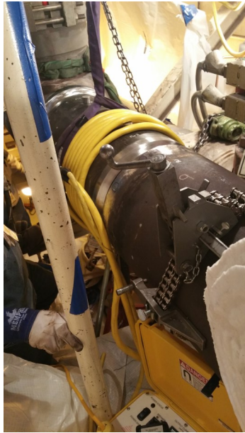
No preheat place cable on pipe