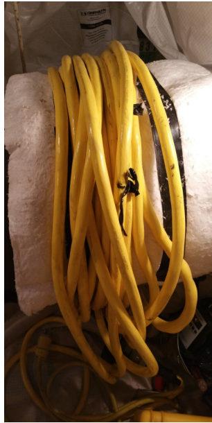
Preheat - keep cable off of pipe with fire blanket or wood stakes