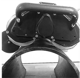
Side View 8"