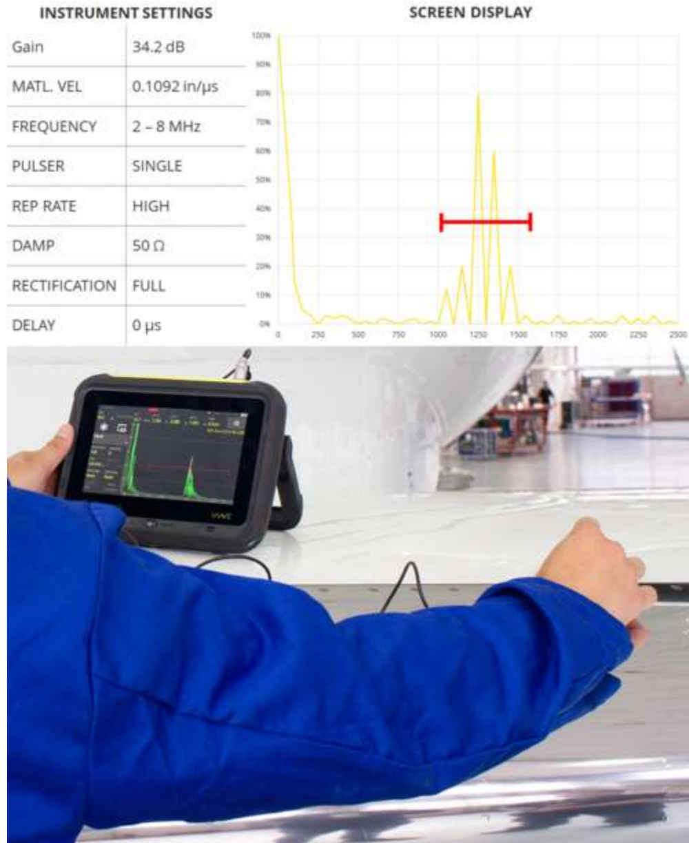
Figure 2 - Optimized menu during inspection

Our emphasis on a lean design philosophy means less training requirements and long-term financial benefits . The intuitive user interface with an easy to use display will guarantee workflow optimization as well as preventing potential operational errors . Nevertheless, any savings on the inspection time will reflect positively on the workmanship .