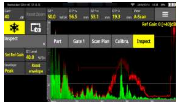
Figure 1 - Enhanced WAVE application based on a specific manufacturing procedure

(Bombardier deHAVILLAND DASH8 series 300)