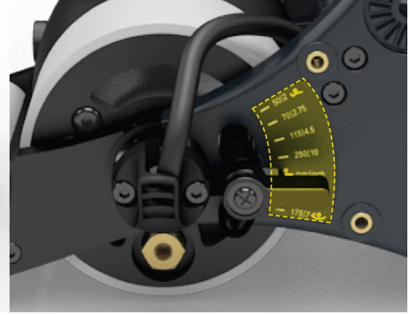
Curvature pointer is a flexible, guick and easy probe adjustment feature to match concave (min 175mm), flat or convex (min 50mm) surfaces.

performance, a large 51.2mm active coverage (64E) and 25mm water path for typical T of 100mm in steel & 50mm in CFRP.