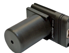
AccuMAX™ XS-555/L Luminance Sensor Detector