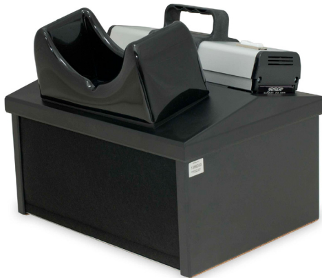
CM-26A UV VIEWING CABINET