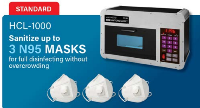
HCL-1000 (UVGI Sanitizing Cabinet)

THE IDEAL UV-C SANITIZATION TOOL FOR HEALTHCARE PROTECTIVE WEAR