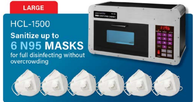
HCL-1500 (UVGI Sanitizing Cabinet)