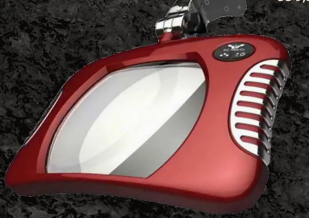
*Only black color available from NDTSupply.com

The Green-Lite® series from O.C. White is the most energy efficient, highest output and longest lasting line of inspection lighting systems in the world. These exceptionally designed products offer important features & benefits available only from O.C. White.