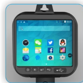
Android Based O/S