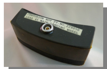
Shown with LEMO Connector