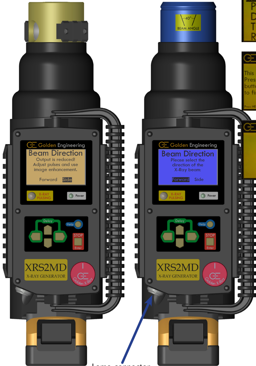
Lemo connector above battery for easier access