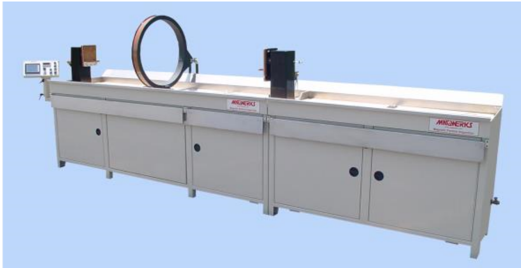
PSAF 1006 with cabinet extension option for 172" part capacity. Model shown with Heavy Duty Oversize headstock and Tailstock and 30" Coil

13-95-09: Startup Materials Group, Level 2 - For Wet Horizontal Machines