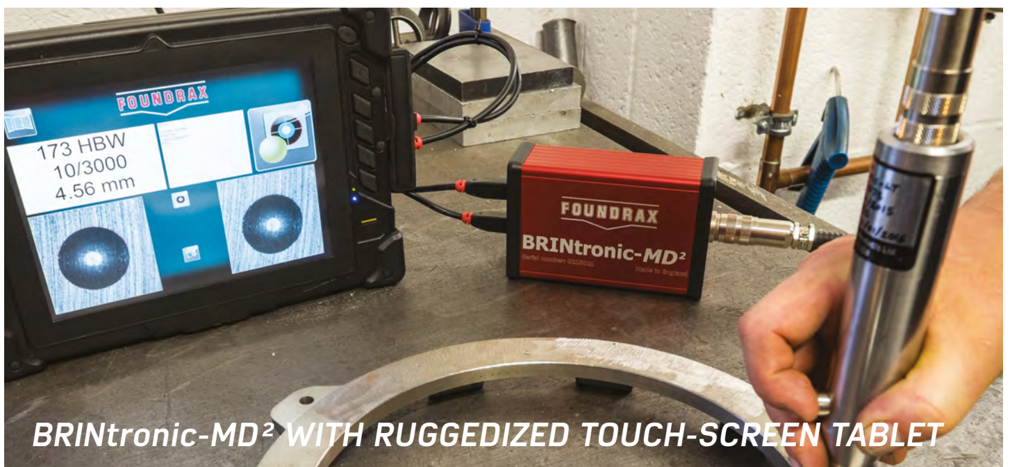
BRINtronic-MD 2 WITH RUGGEDIZED TOUCH-SCREEN TABLET

The BRINtronic fully automatic Brinell microscope can be ordered as: (1) a USB powered connection compatible with any computer or touch-screen device; (2) a PC system supplied pre-configured ready to go; or (3) with laptop computer ready configured and contained in a rugged industrial carry case.