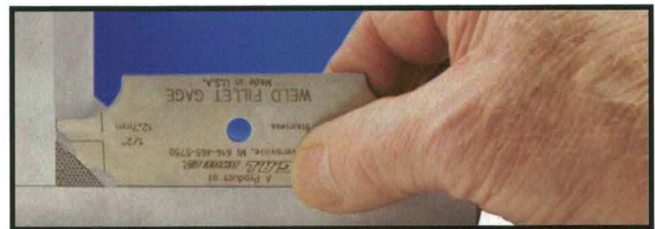
CHECKING FILLET THROAT SIZE