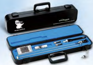
Hawkeye Classic Kit

A Mini Maglite® flashlight is supplied with every Hawkeye borescope. Higher intensity light sources like the Super-NOVA™ Light and the Luxxor 24 Light (shown on the reverse) are also available.