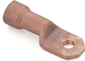
Part Number: 2590