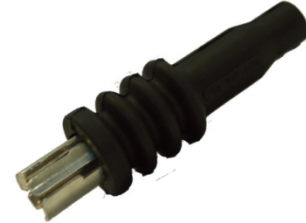
Part Number: 1238