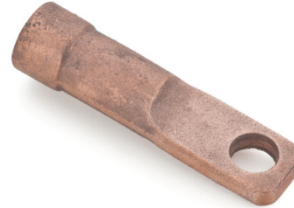
Part Number: 2592