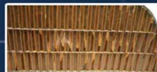
Multiple core sheets