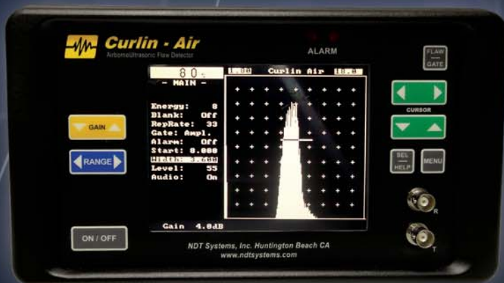
Curlin Air- Inspection of composites using air-coupled ultrasonics