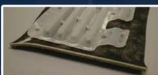
Plastic to foam welds