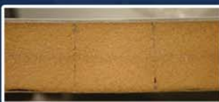
Glass fiber skins, wood core