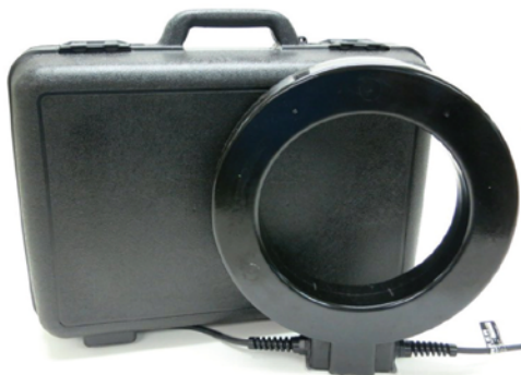
PL-10 with Case

For the correct and safe use of this equipment, proper training of operating personnel to required inspection techniques, specifications and safety requirements is necessary, and is the obligation of the user.