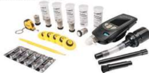
PosiTector CMM IS Pro Kit includes the PosiTector DPM Advanced

Replacement chambers, salt solutions, tools, caps and fins are available upon request